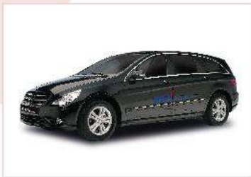
Grand hearse 豪華靈車