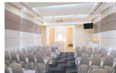
Standard Parlour 標準追思禮堂