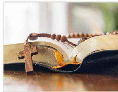
Hymn book, cross 聖詩手冊，十字架