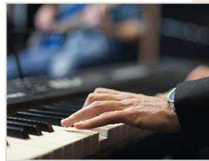
Professional music band 專業音樂隊