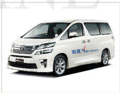
High range hearse 高級靈車 NV GRACIOUS 富貴聖恩