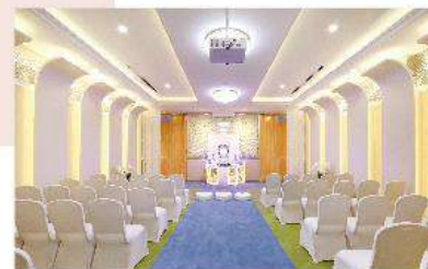
Standard Parlour 標準追思禮堂

一場莊嚴的告別儀式，承載了對摯親的哀思，承載著深深的祝福，身為這道關卡的守門人，富貴禮儀團隊一直秉持“事死如事生”的專業態度，從防腐、淨身、化妝、入殮至追思禮拜，我們堅持給予您的摯親至高無上的尊重，務求以最貼心的服務品質以及匠心的產品素質禮讚生命。