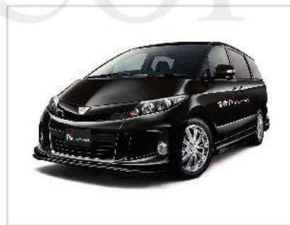
Standard hearse 標準舒適靈車 NV BLESSING 富貴祝福