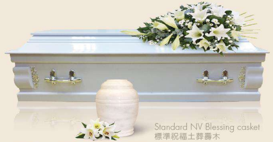
Standard NV Blessing casket 標準祝福土葬壽木