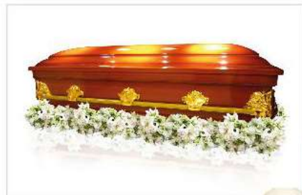
Standard NV Harmony casket & urn 標準永康土葬壽木&骨灰甕