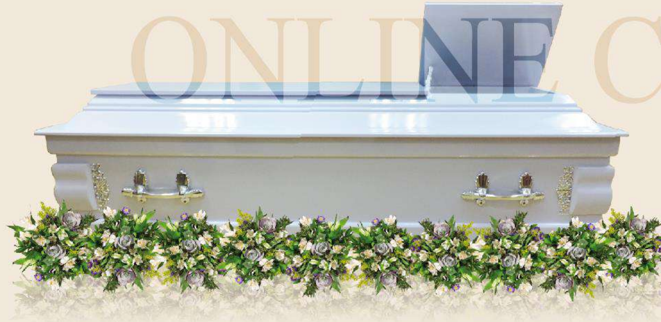
Premium NV Gracious casket & urn 精緻聖恩土葬壽木&骨灰甕