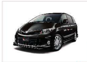
NV ELEGANT 富貴安祥