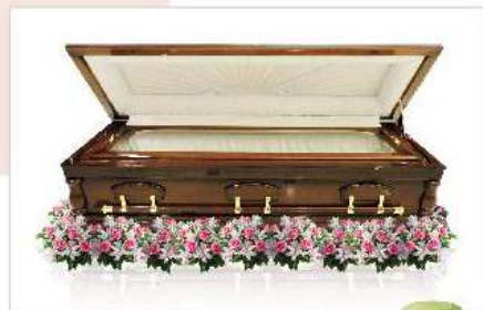
Premium NV Elegant casket & urn 精緻安祥土葬壽木&骨灰甕