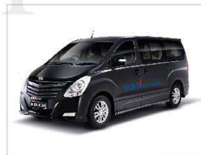
Luxurious limousine 豪華禮車 NV GRACIOUS 富貴聖恩